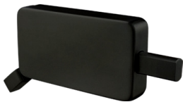
BD1022 Standard 13/16" Thumb lever