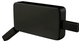
BD1023 ADA 1-9/16" Thumb lever