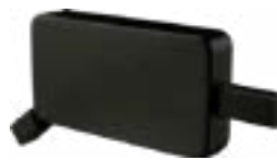
BD1022 Standard 1" Thumb-lever