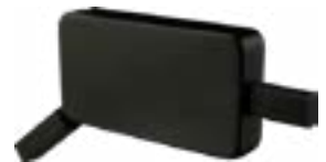
BD1023 ADA 1-3/5" Thumb-lever