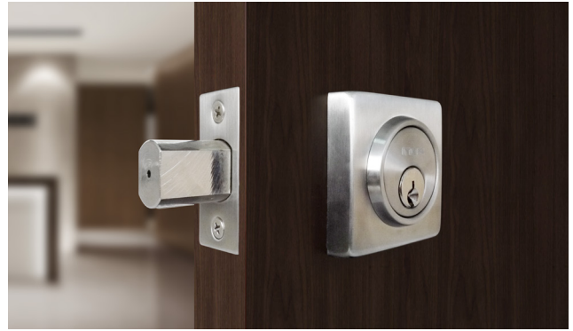
LD Series Deadbolt