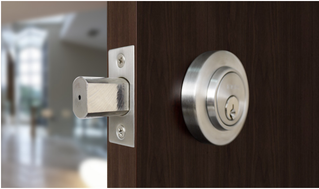
CD Series Deadbolt