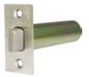
LSL08N 5" Spring Latch 1-1/8" Faceplate