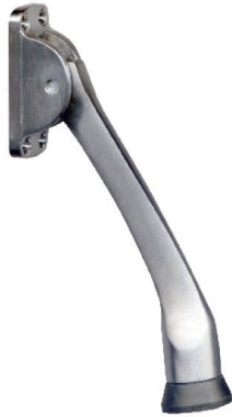
DH235 Drop Down Door Holder