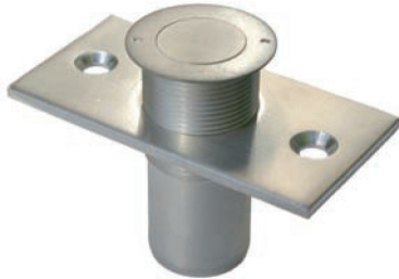
DPS280 Dust Proof Strike