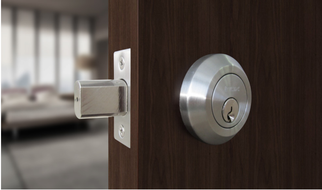
RD Series Deadbolt