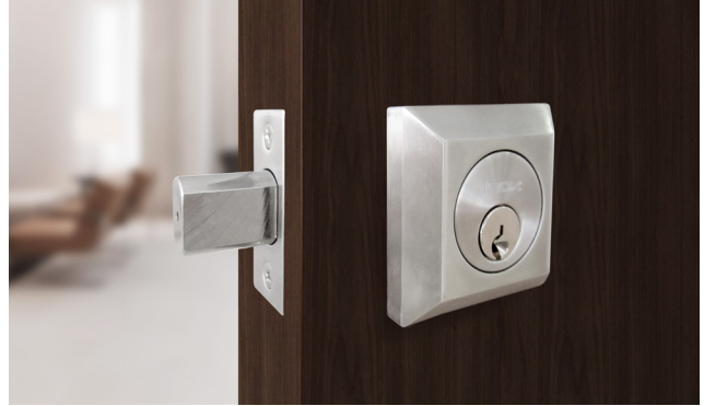
SD Series Deadbolt