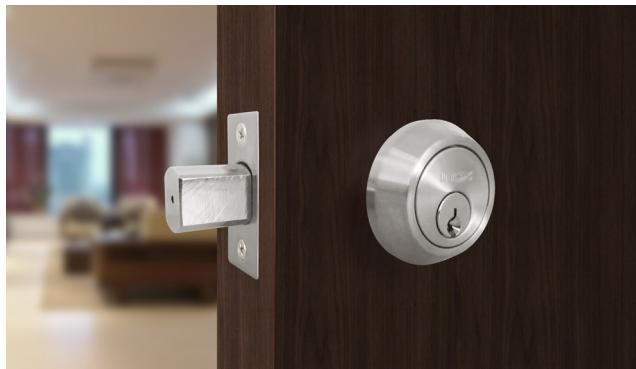
GD Series Deadbolt