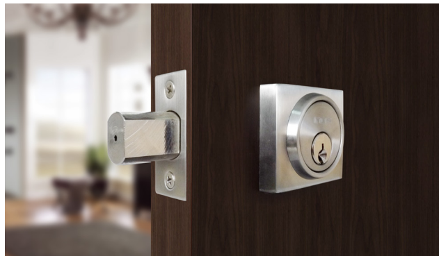
HD Series Deadbolt