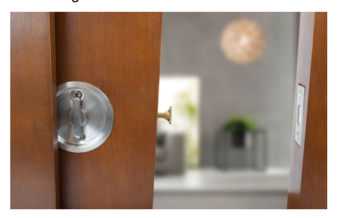
INOX's TwistLock™ offers both a lock and an edge pull that rotates to easily slide the door open or closed. It is the industry's only lock and edge pull combination offered in stainless steel.